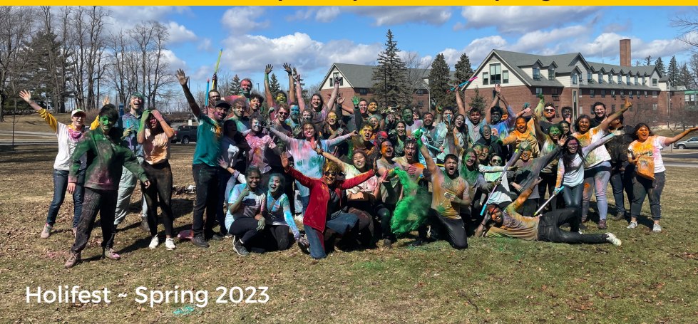
Holifest ~ Spring 2023

*MBA students should participate in the spring semester only , as there are more course offerings.